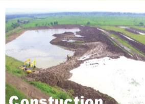
Construction Ongoing rehabilitation work of financing part of the seven nominated reservoirs in Lamongan.