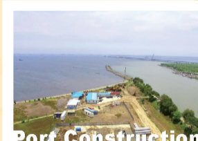
Port Construction PT Kawasan Pantai Muara (PMU) plans to build a new port in the Muaranda area, North Jakarta. This port will support goods and truck traffic, activities for the domestic short sea shipping program.